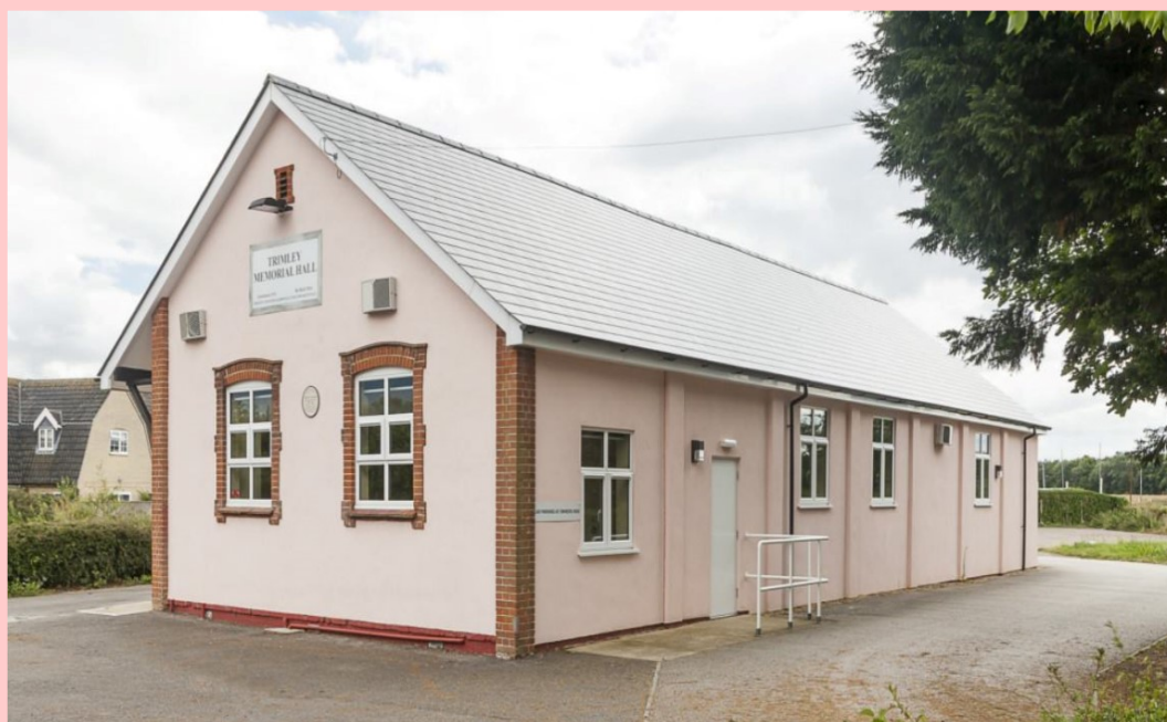
Trimley St Martin Memorial hall - Worship evening Saturday 23rd October 7.30pm