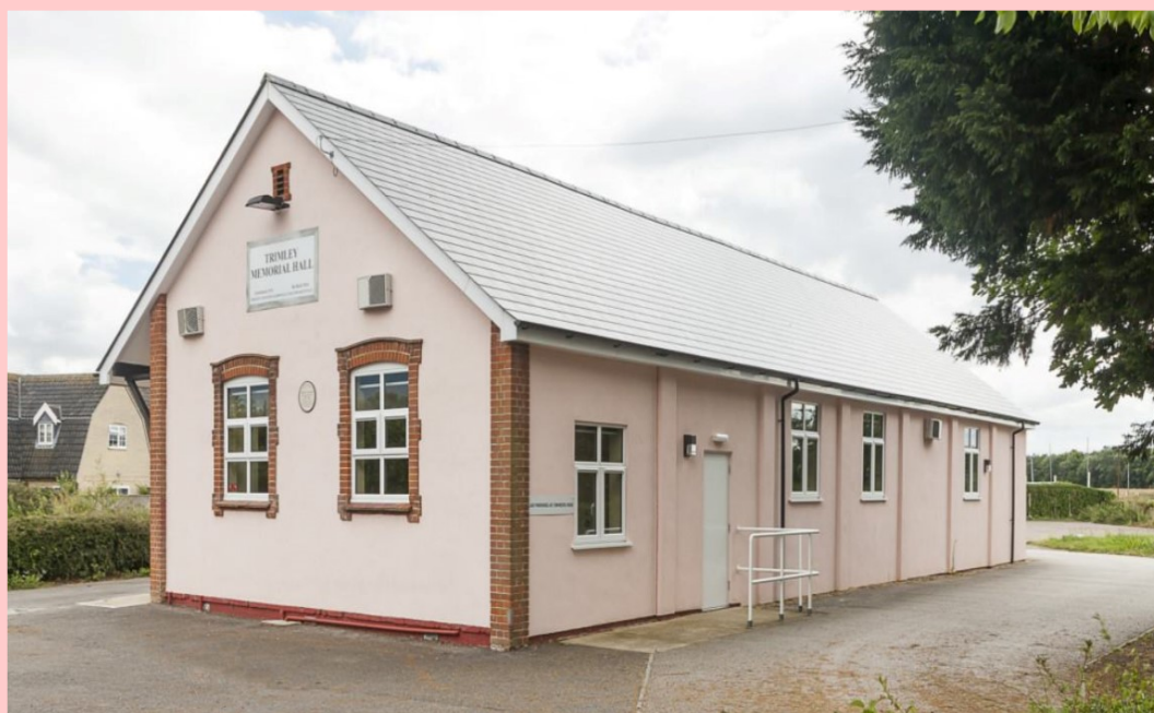
Trimley St Martin Memorial hall - Worship evening Saturday June 26th 7pm