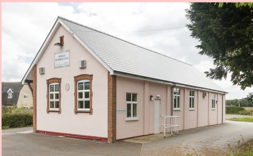
Trimley St Martin Memorial hall - Worship evening Postponed until further notice