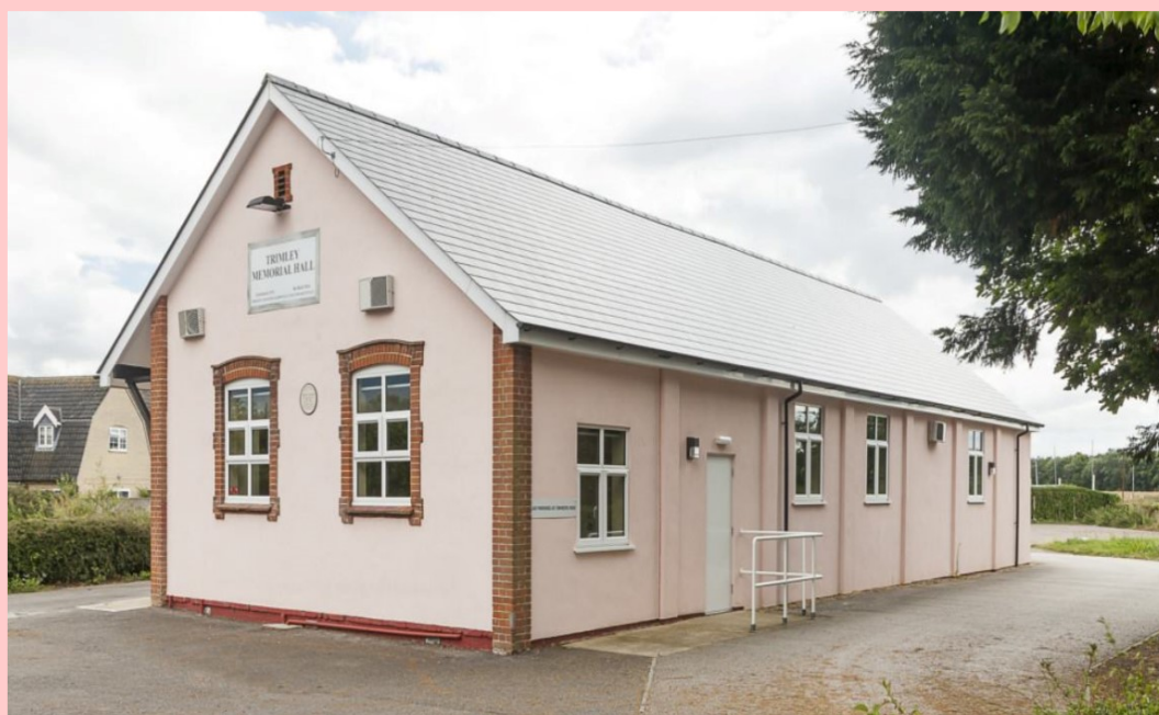
Trimley St Martin Memorial hall - Worship evening Postponed until further notice