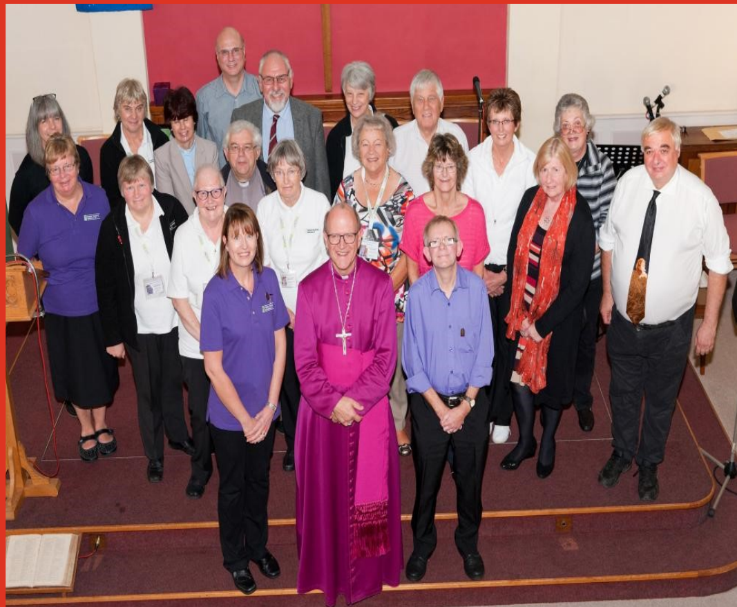
Parish nurses at Walton Felixstowe – Offering an integrated approach to healthcare and healing. www.cofesuffolk.org/news/article