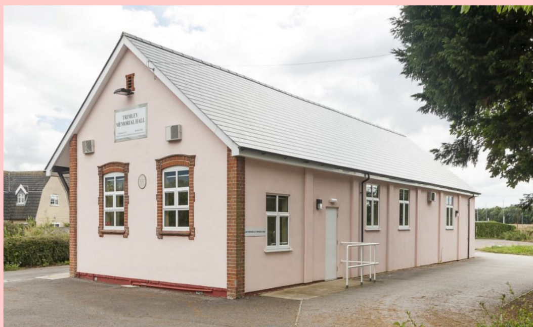
Trimley St Martin Memorial hall - Worship evening Saturday August 25th 7pm